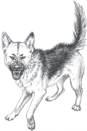
Drawing 1. Offensively threatening dog

Offensively threatening dogs try to make themselves look bigger and more menacing.