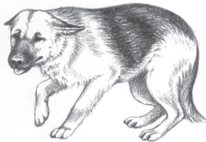
Drawing 2. Fearful dog

Fearful or submissive dogs try to make themselves look smaller and less menacing.